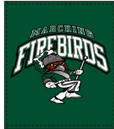
50" X 60" SWEATSHIRT MATERIAL BLANKET